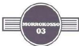
MORROKOSSO 03 (and LOGO)